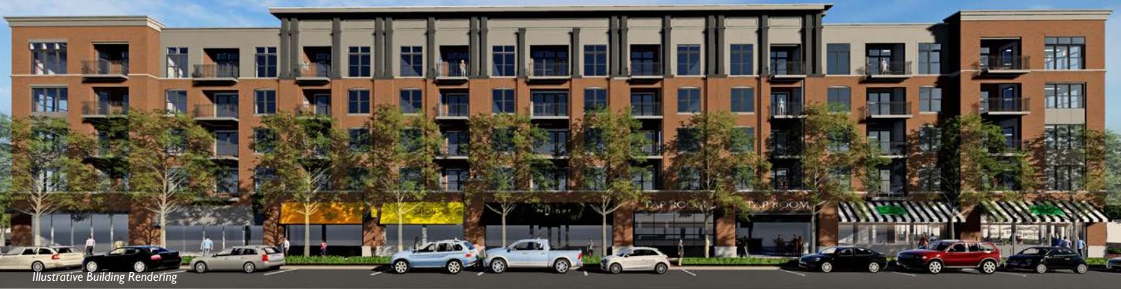
Illustrative Building Rendering