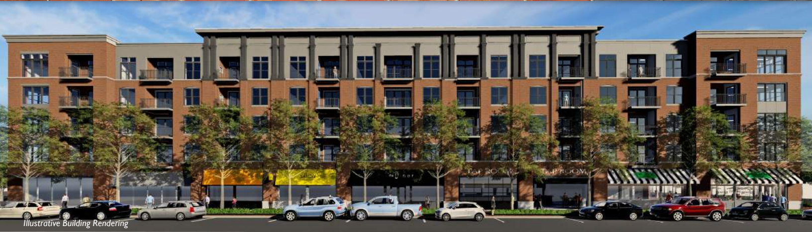
Illustrative Building Rendering